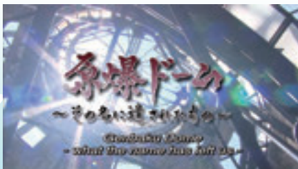
The dome speaks out -Commemorating the Preservation of the A-Bomb Dome- First aired on August 6, 2019