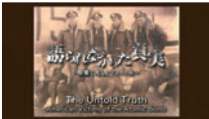
The Untold Truth -American Victims of the Atomic Bomb- First aired on August 6, 2004