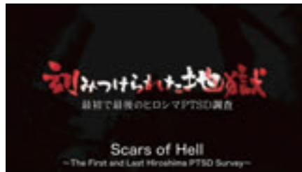
Scars of Hell -The First and Last Hiroshima PTSD Survey- First aired on August 6, 2010