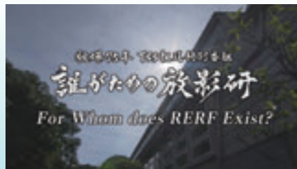
For Whom does RERF Exist? -TSS Special Documentary for 75 Years Since the Atomic Bombing- First aired on August 6, 2020